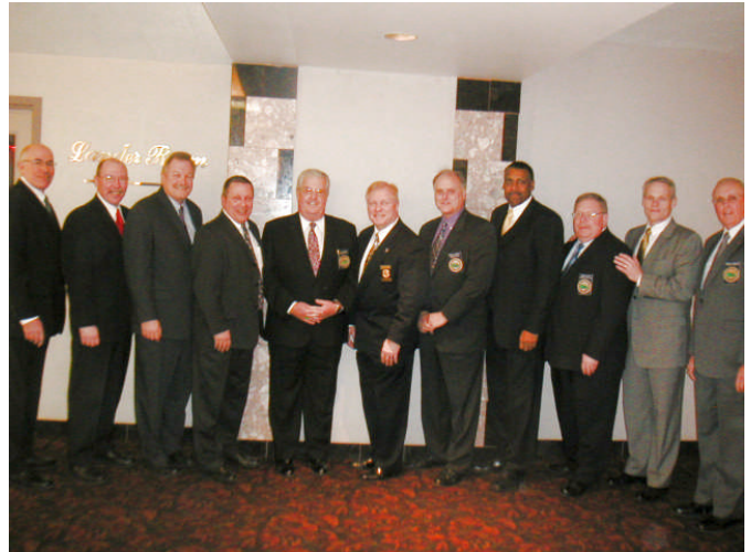
Pictured Above: The 2011 Cuyahoga County Police Chiefs Association Officers and Board of Governors and Executive Director.